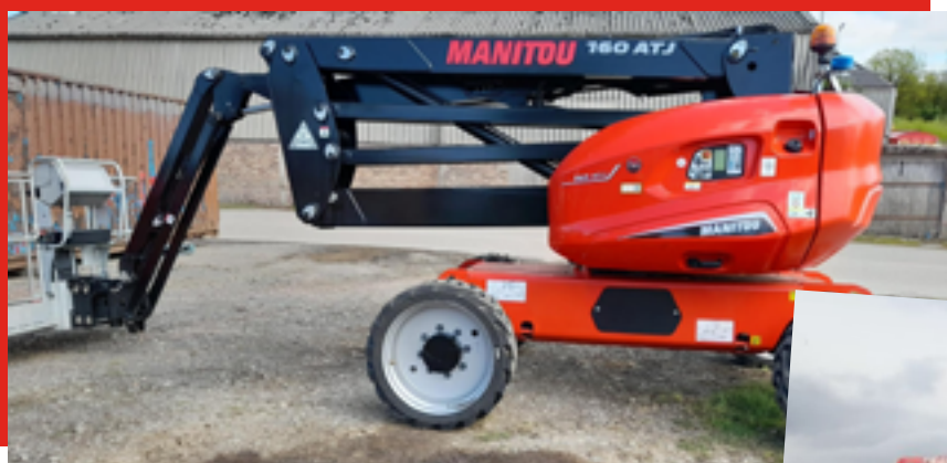
Telehandlers (MT1440 Easy, Manitou) at Tulliallan and Northfield