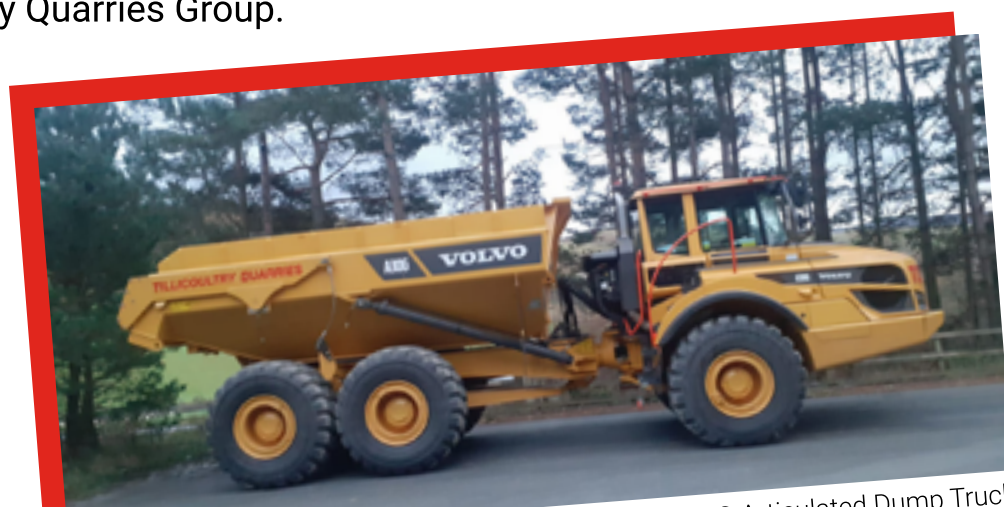
Volvo A30G Articulated Dump Truck

We're pleased to share our recent investment in new equipment and machinery for Tillicoultry Quarries Group.