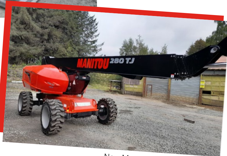
New Manitou 280TJ at Northfield