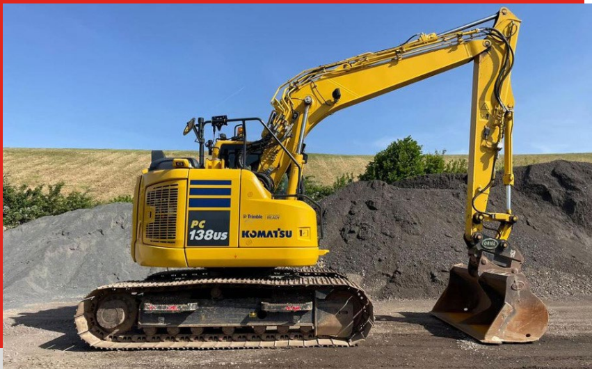
New Komatsu PC138 Excavator for Northfield