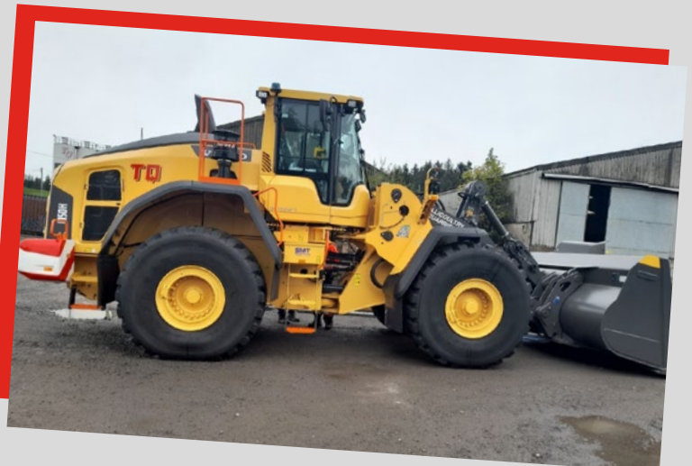
New Volvo L150 for Clydebridge