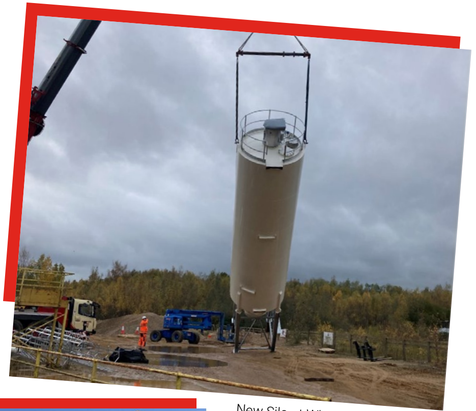
New Silo at Whisby Concrete Plant