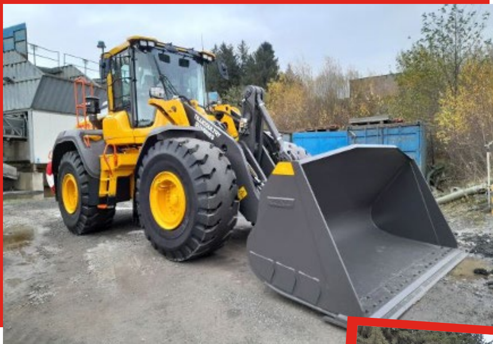
New Volvo L150 for Northfield

We're pleased to share our recent investment in new equipment and machinery for Tillicoultry Quarries Group.